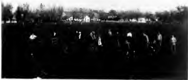
Short Course in Viticulture, Old Putah Creek Vineyard south of First Street in the city of Davis, c. 1915.